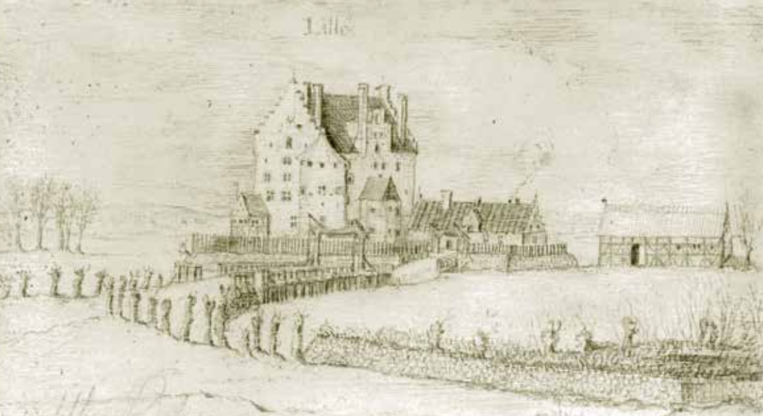
Erik Dahlberg drew this sketch of Lillö Castle in 1658.