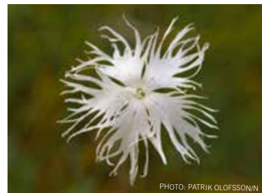
One project spreads knowledge about the species of the sandy grasslands.