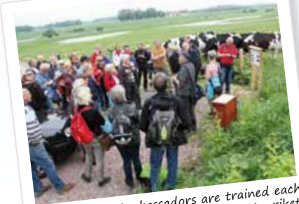
30 Biosphere Ambassadors are trained each year to spread knowledge about Vattenriket.