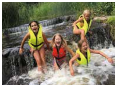
Fun and games can help change attitudes and make sustainable use of nature's gifts.

Species diversity and efficient ecosystems enable us to cope better with climate change and other challenges – progress that benefits both nature and people.