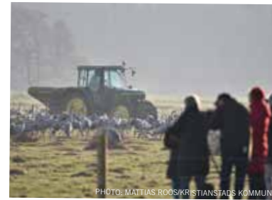
Diversionsary feeding reduces crop damage and lets us get closer to the cranes.