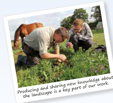
Producing and sharing new knowledge about the landscape is a key part of our work.