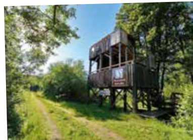
Our 21 visitor sites have displays, observation towers, boardwalks and marked trails.