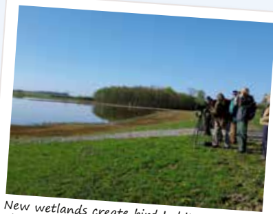
New wetlands create bird habitats and reduce nutrient run-off in Hanöbukten Bay.