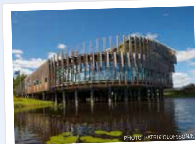
The naturum Vattenriket visitor centre welcomes over 100,000 visitors a year.