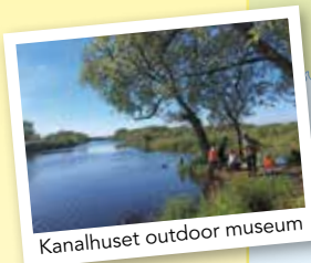
Kanalhuset outdoor museum