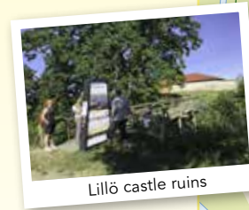
Lillö castle ruins